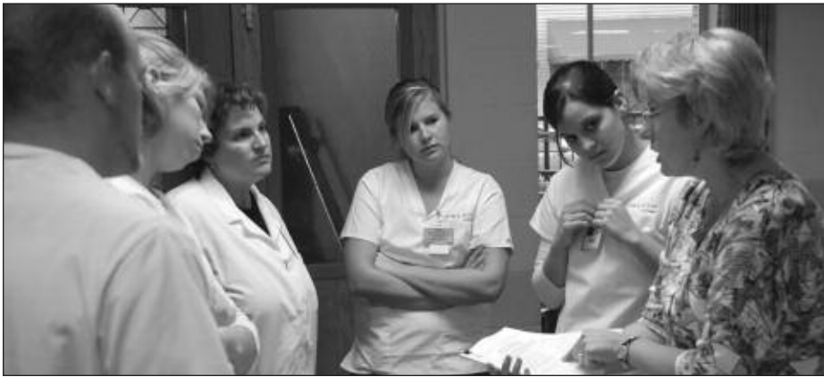
....but it all can be soooo rewarding