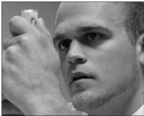
Student nurses from Calvin College learn how to administer flu shots at a Supper Club. The instruction, above, can be very serious...below very precise...