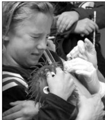
...The process calls for a gentle touch and extreme care in a challenging moment...